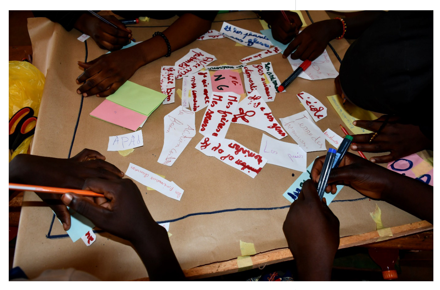
A socio-environmental map created by girls in Ouahigouya. During this activity young people identified the most important elements of their daily life (people, places, things, and events) by drawing or writing them and then placing them on a map created by the group.

Young people's spontaneous references to their education and professional future underscores that having a "role and responsibility" is central to their psychosocial well-being. Currently only 36% of adults surveyed believed that the aid they received would help them live without aid in the future. Young people are developing during situations of humanitarian crisis and need specific support that takes this into account. They need to be able to actively contribute to society. This is particularly important for young people with disabilities, who find their capacity to contribute mostly or completely impeded. To better support young people's well-being, humanitarian organisations must collaborate with development, peace, and government agencies to ensure that long-term needs are addressed alongside immediate needs. Every child should be able to access a standard of living adequate for their physical, mental, spiritual, moral, and social development.