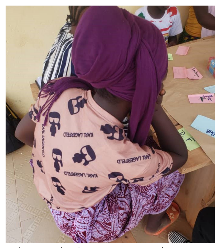
A girl in Tougan works on the group's socio-environmental map.

Of course, confounding humanitarian organisations and government agencies, as well as being unaware of what goods and services qualify as assistance and those that do not, are not necessarily red flags. This lack of knowledge, however, about what is going on in their community and the ability to participate in conversations about aid programming requires critical attention, given that young people have a right to participate<sup>27</sup> and a right to information.<sup>28</sup>