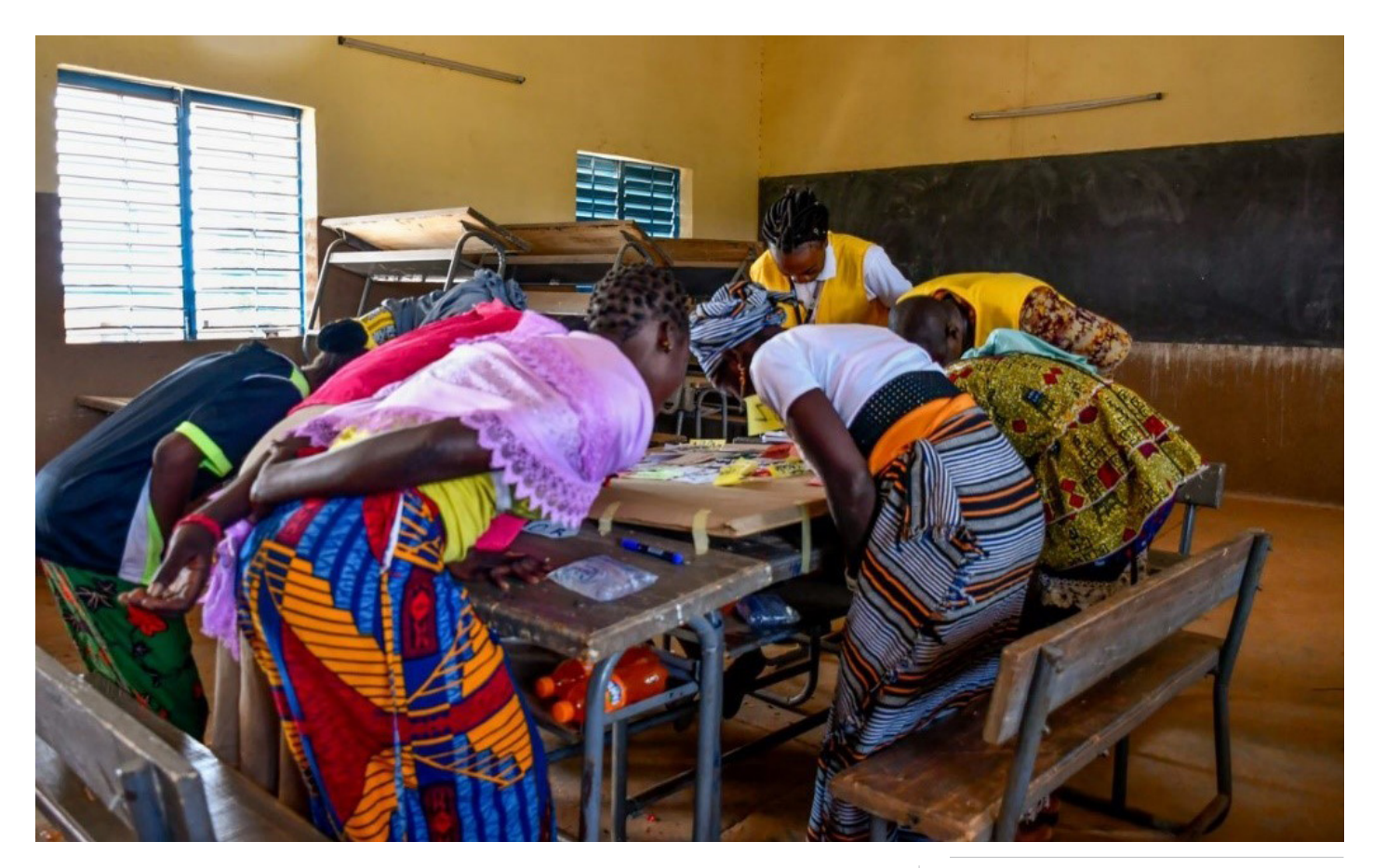
Girls in Ouahigouya working on their socio-environmental map. During this activity, young people identified the most important elements of their daily life (people, places, things, and events) by drawing or writing them down and then positioning them on a map designed by the group.