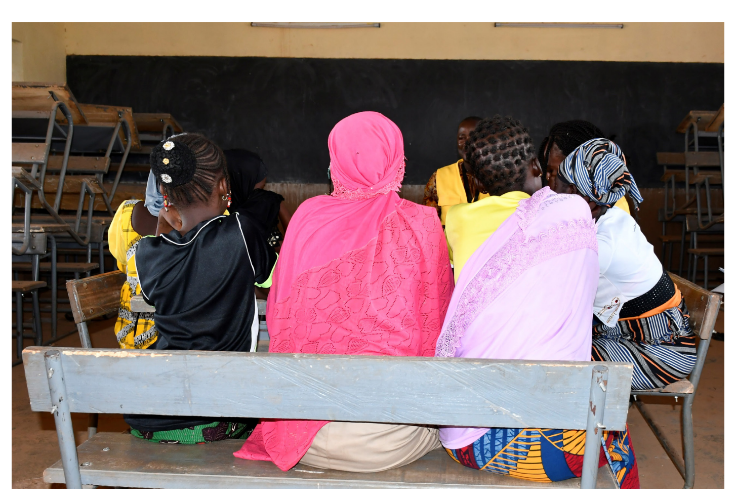
Girls in Ouahigouya participate in a focus group discussion activity.