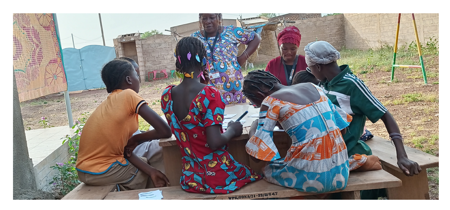
Girls in Tougan participate in a socio-environmental mapping activity. During this activity young people identified the most important elements of their daily life (people, places, things, and events) by drawing or writing them and positioning them on a map designed by the group.