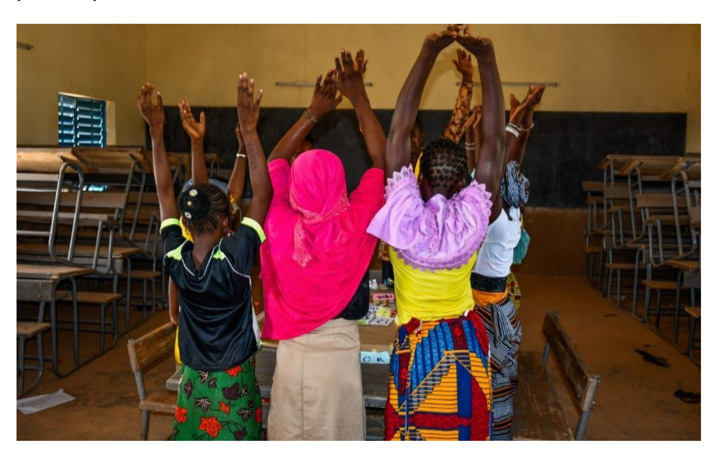
Girls take part in an ice-breaker activity in Ouahigouya.