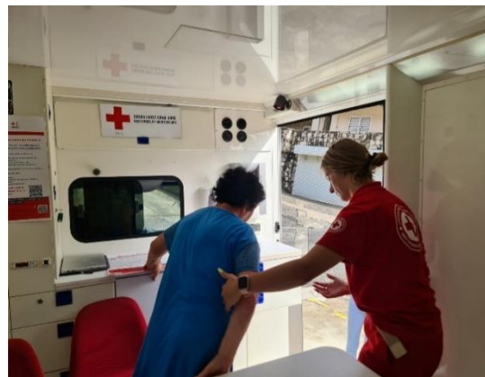
RCM Mobile Office supporting vulnerable people with AccessRC registration.