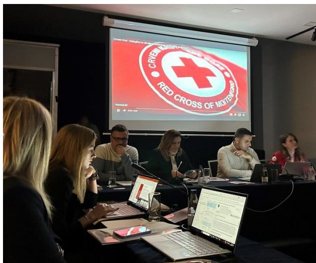
RCM representatives presenting their activities at the Lessons Learned Workshop.