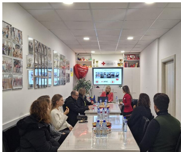
Field visit to the local Red Cross branch in Budva. Participants discussing various aspects of the branch's operations.