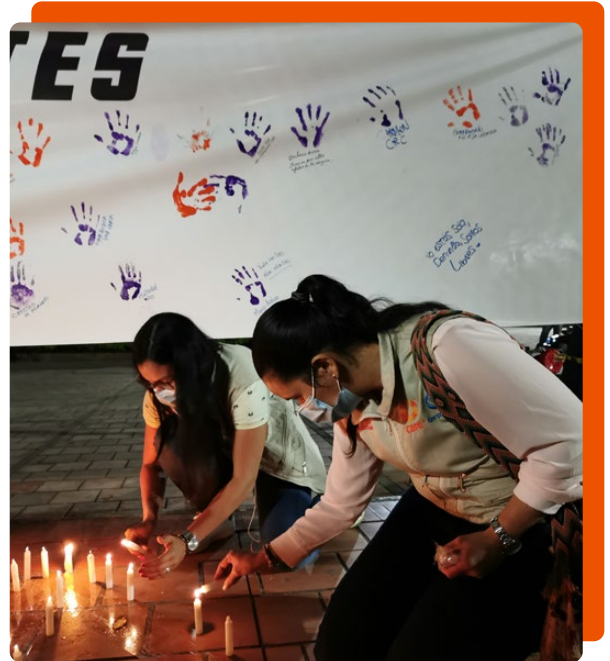
© CARE 2021 Commemoration during the 16 days of activism to end GBV campaign of lives lost because of GBV, Ocaña

Future cash-integrated and CVA-integrated GBV programming that supports GBV survivors in their recovery should leverage the aforementioned opportunities to efficiently and effectively provide quality services and to generate and continue to take up evidence-based practice in this context and in others across Latin America and the Caribbean.