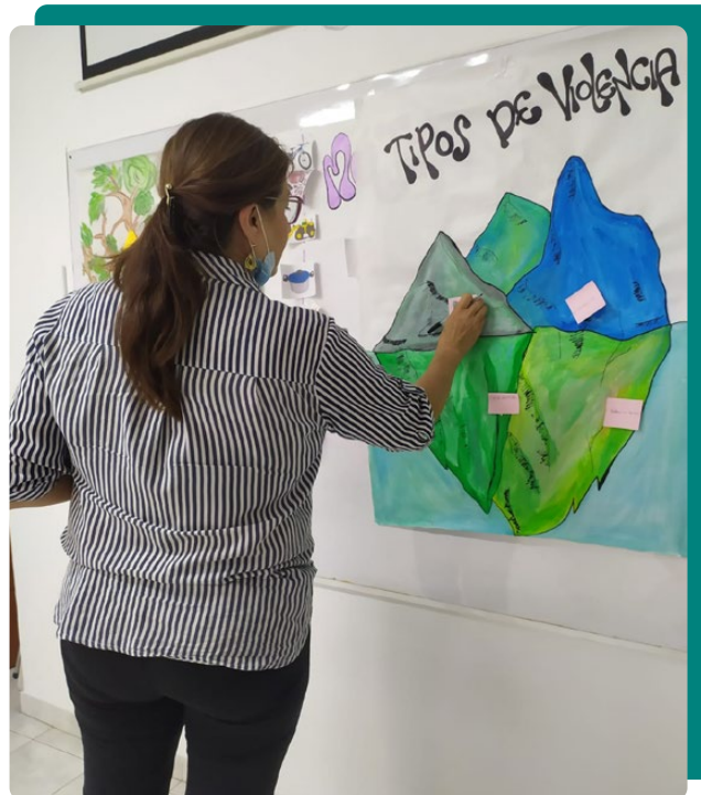
Cash-GBV Case Management Program participant participating in an activity identifying types of GBV, Ocaña