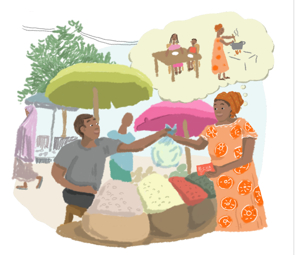
Women widely believe that they are more inclined to use CVA for the collective well-being of the family, and especially for their children.

If men were given these cards, a lot of women would have been divorced as the men would use the money to remarry.