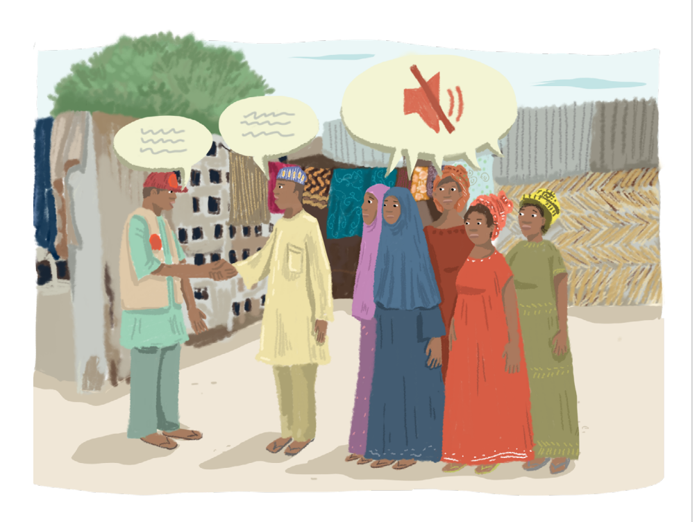
Women feel marginalised and excluded by their community leaders, who act as gatekeepers and have privileged access to humanitarians.

Another challenge to women's participation, closely intertwined with socio-cultural norms, is the overarching power held by their male community leaders, commonly referred to as the bulama in host communities or camp chairmen in IDP settlements. Although their specific role varies across communities, these leaders typically act as liaison points between affected communities and humanitarians. They grant access to communities, provide insights into community needs and priorities, support the identification of potential CVA recipients, and facilitate communication, notably by conveying community feedback to humanitarians. Although community leaders play a crucial role in facilitating the humanitarian response, they can also contribute to the exclusion of people from humanitarian assistance.<sup>7</sup>