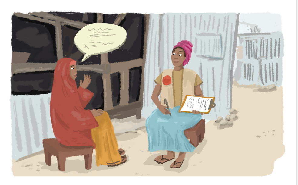
Women want more face-to-face contact with humanitarian actors, perceiving them as impartial and trustworthy due to their outsider perspective.

These comments underscore the fact that women's representatives, as members of society, are embedded in community dynamics and susceptible to potential biases, including those stemming from socio-cultural norms and practices. In discussions with women's representatives, it became apparent that people do not necessarily see conflicts within households, even if they relate to CVA, as relevant to humanitarian organisations. Instead, women's representatives tend to involve male community leaders, who hold authority to address and reprimand men for their behaviour. Although this community protection mechanism can be effective, it can become problematic if humanitarians are unaware of tensions arising directly from the CVA they are implementing. This demonstrates the importance of direct engagement between humanitarians and women who receive CVA, requested by women themselves: "We like it so much when you come to us one-on-one, without having a third party or having to say it out in public or going through the community leader."