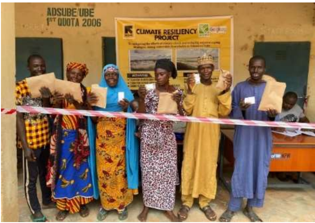
Clients display cash envelopes after receiving cash grant during pre-shock cash distribution.