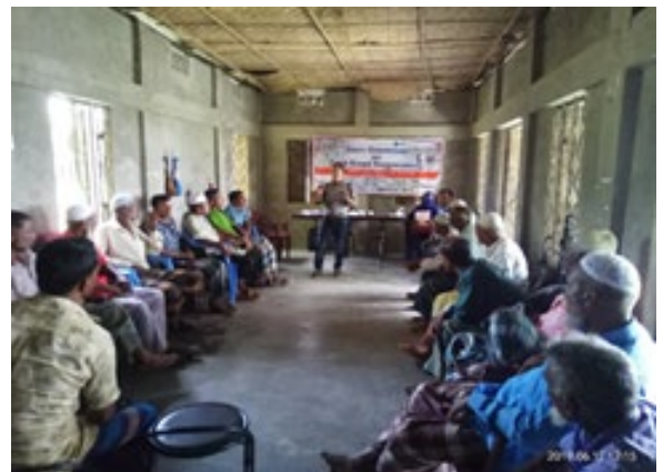
CVA training session for 60 staff and community members in preparation for flood response in Bangladesh