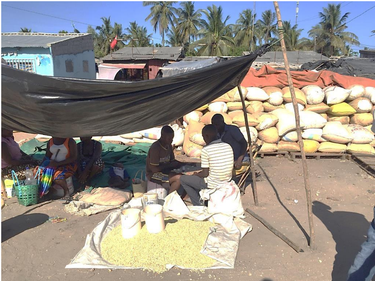
(Maize retailers/wholesalers in Beira market)

INFORMAL RETAILERS/WHOLESALERS: The majority of trade in non-processed maize grain is conducted by small scale retailers who often double as wholesalers. Many travel to surplus producing areas and do off-take directly at the farm-gate while others procure stocks from traders along the major transportation corridors. Retailers who were interviewed noted little to no impact of El Nino induced drought on their business aside from a shift in geographic procurement location away from local areas further away towards Angonia District (Tete Province) and Guro District (Manica Province). This trade system although informal appears very well established. Observed stocks ranged from 20-100 bags (50 kg each) and retailers noted significant competition in the market place (15-30 actors). It was noted that there were a few large scale commodity aggregators (e.g. Deca) who had established collection points in certain locations.