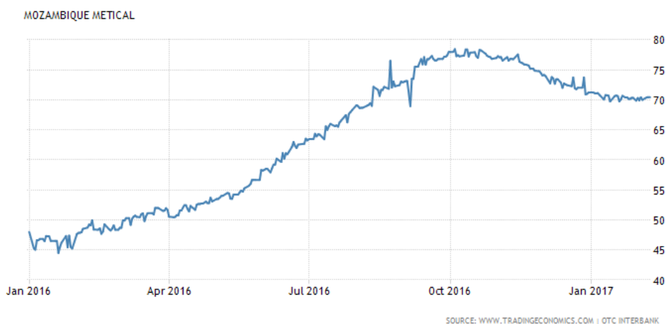
Figure 2. Mozambique Metical to USD (Jan 2016-Jan 2017)

Source: http://www.tradingeconomics.com/mozambique/currency